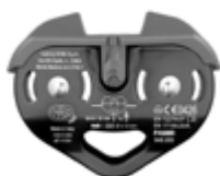
Kong Pamir Fast Tandem Pulley