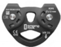
Singing Rock Tandem Pulley